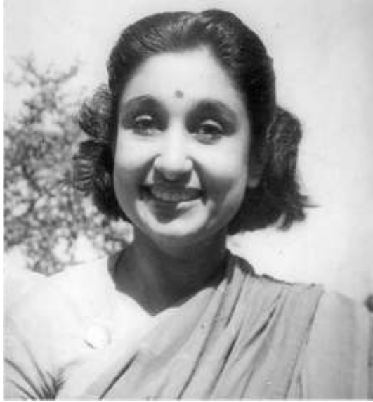
Captain Lakshmi Sehgal (Rani of Jhansi Regiment, INA)